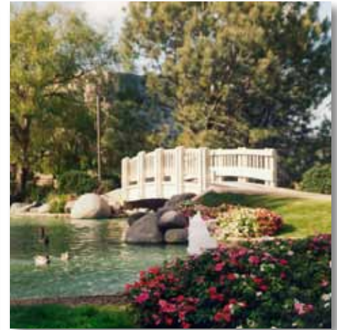
Torrey Pines Science Park