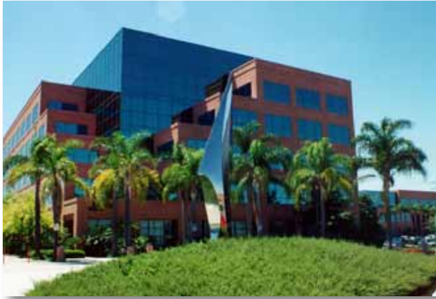
Governor Business Park