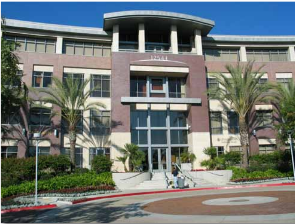
Plaza Del Mar