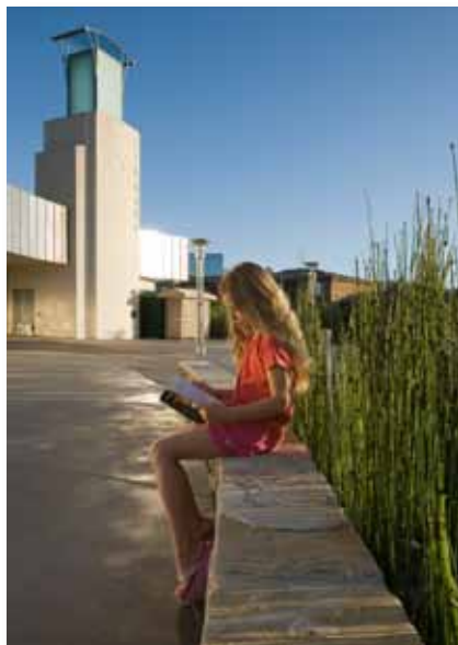
Mission Valley Library, San Diego