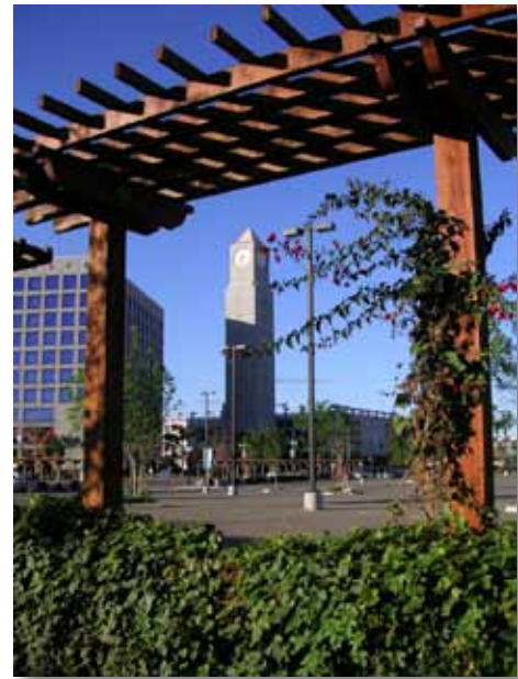
Ballpark Infrastructure, San Diego