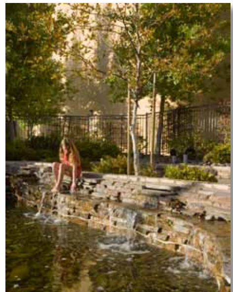
Mission Valley Library, San Diego