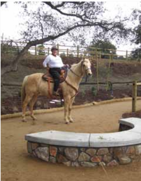
Valley Center Heritage Trail, Valley Center