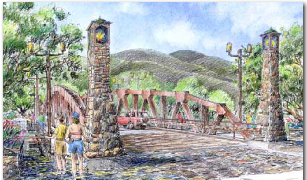
Main Street Bridge, Temecula