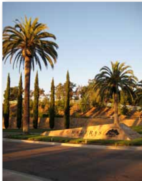
Old Coach Road, Poway